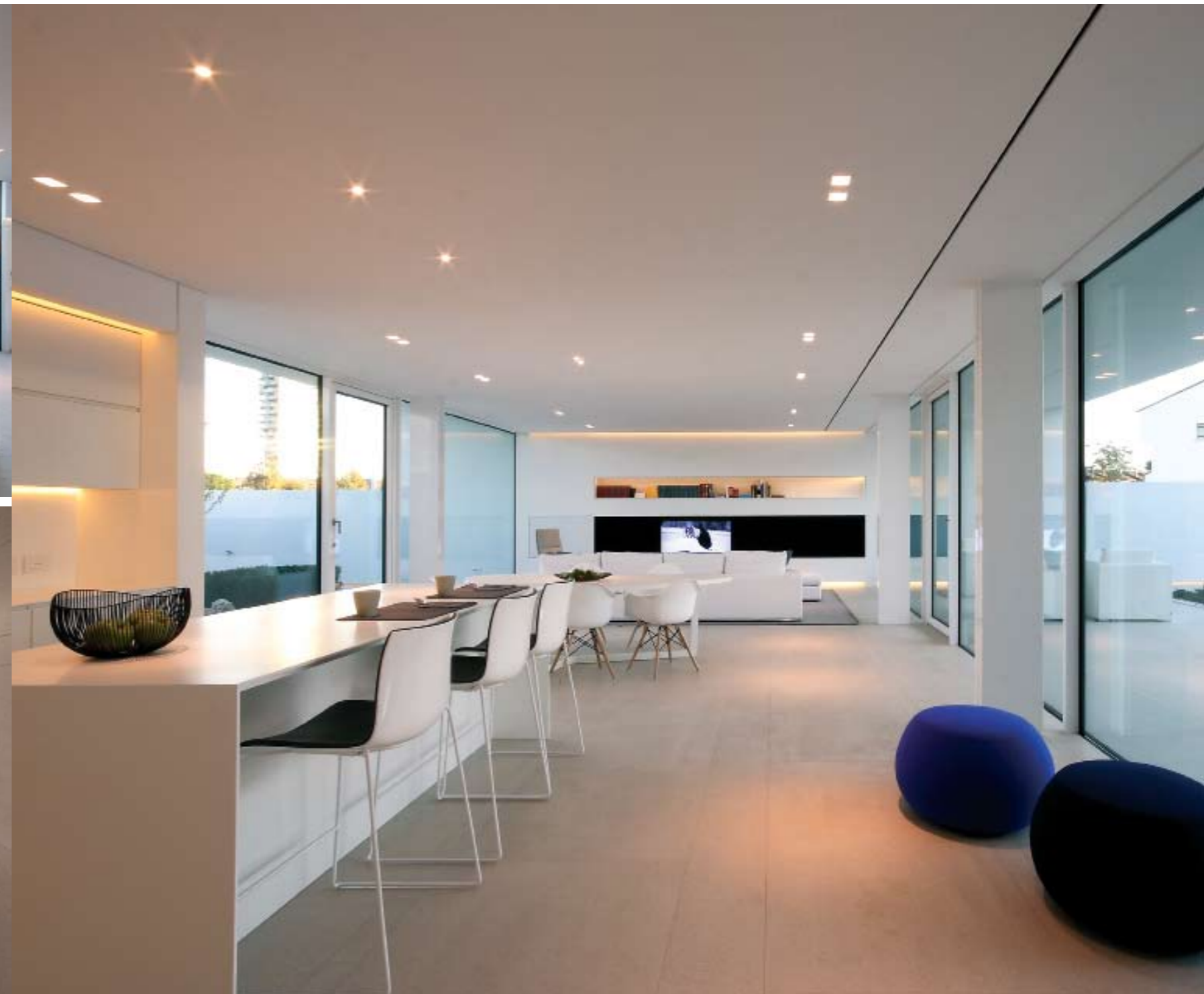
from above to below: glazed living area, kitchen with view towards living area