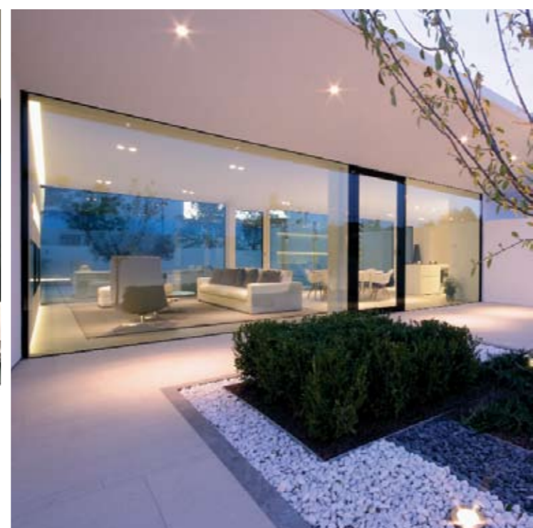
from above to below, from left to right: swimming pool, covered terrace, patio