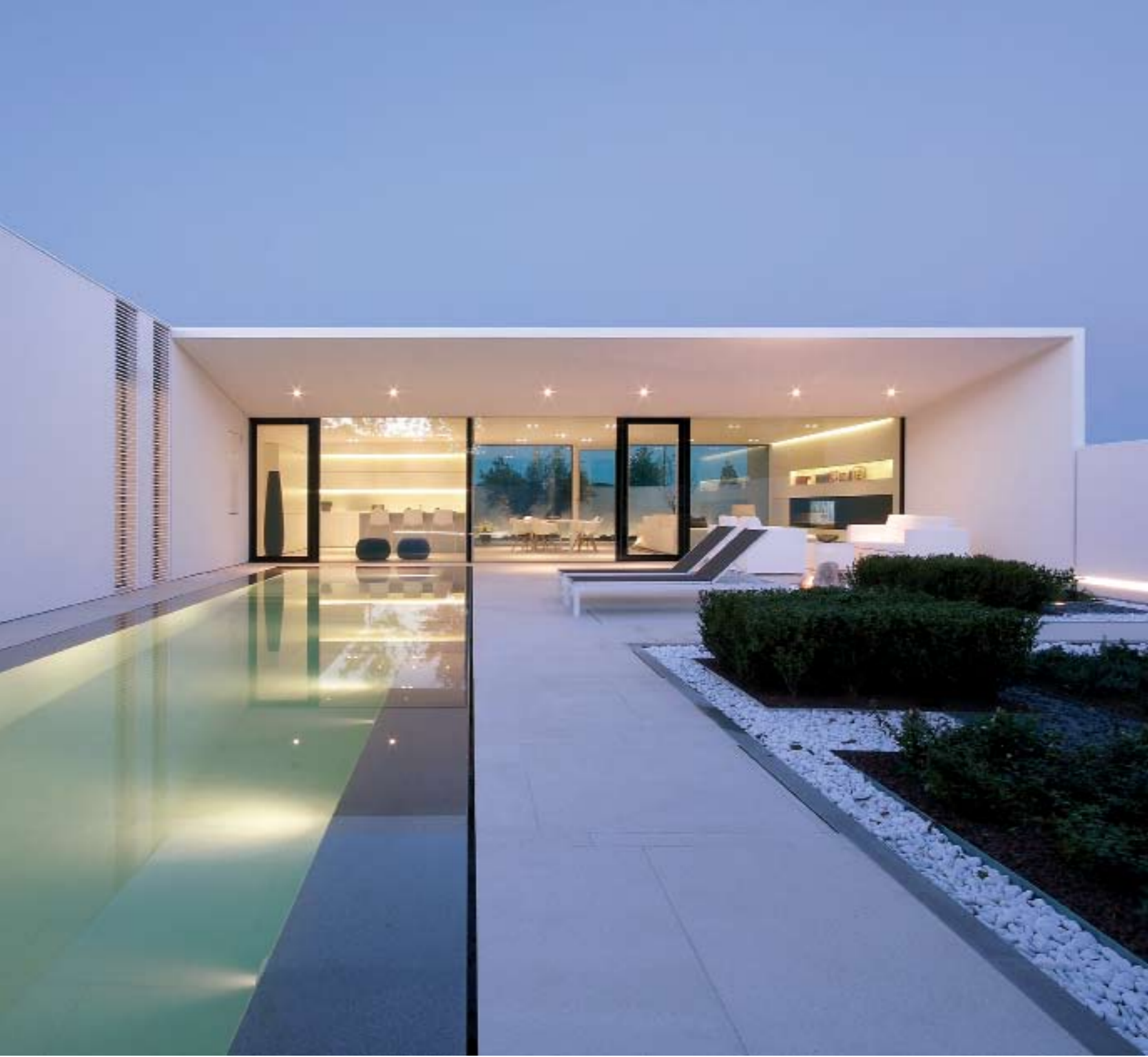
garden with pool at dusk